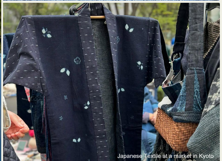
Japanese Textile at a market in Kyoto