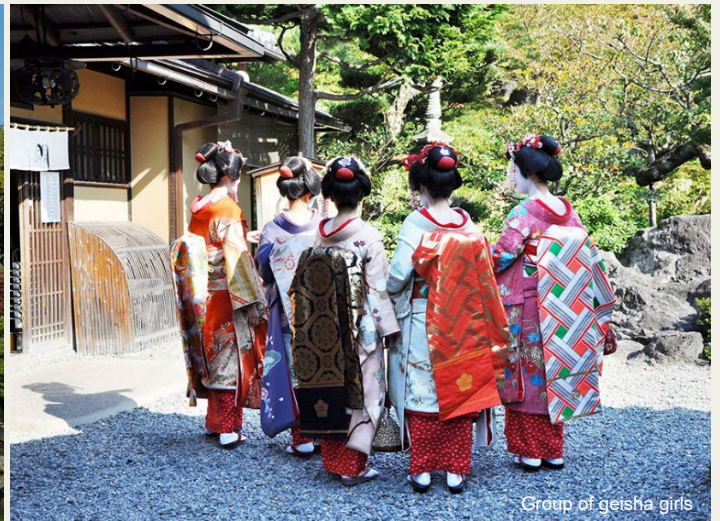
Group of geisha girls