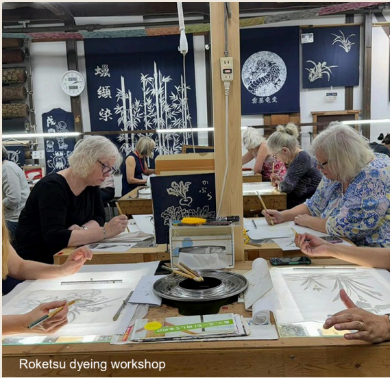
Roketsu dyeing workshop